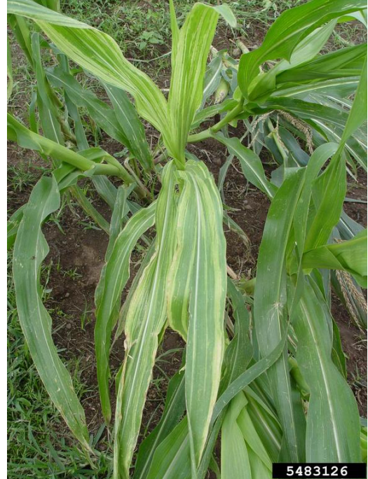
Philippine downy mildew ( Peronosclerospora philippinensis).

If you have question or concerns regarding the headlines, OR you believe you have identified a Philippine dewy mildew infestation, contact invasives@shsu.edu for further instructions.