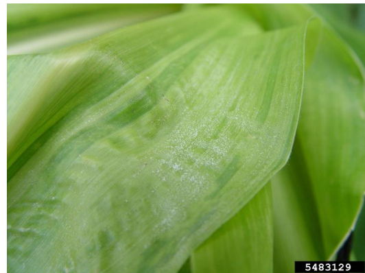
Downy fuzz on philippine downy mildew infested leaves.